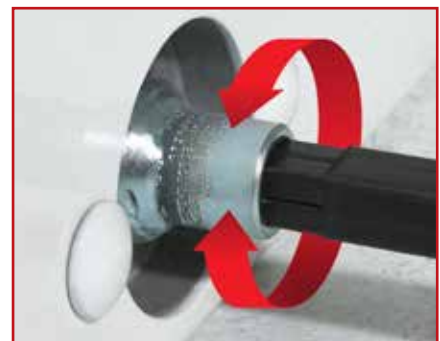
drive extension safety design helps prevent operator damage