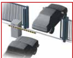
automatic sequencing when used in conjunction with slide or swing gate operators